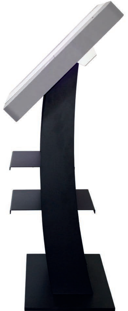
Pedestal wave mini side view