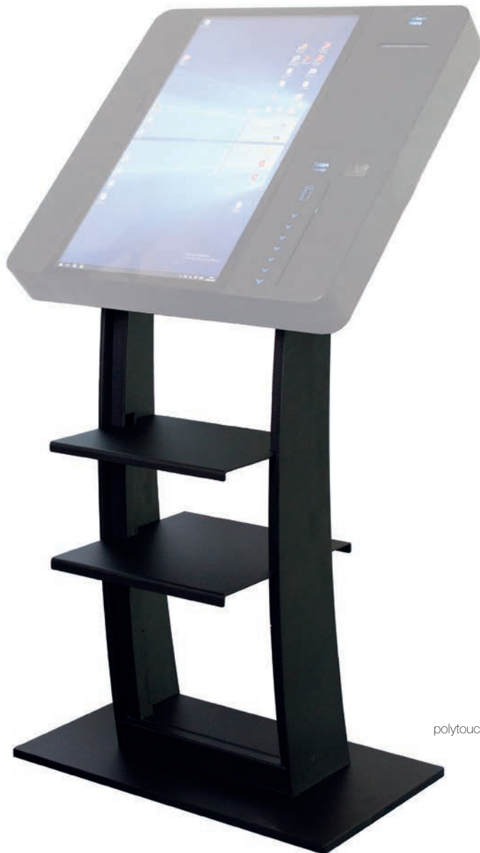
polytouch ® 24 portrait with pedestal wave mini