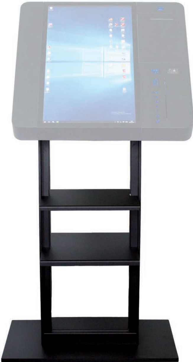
Pedestal wave mini front view